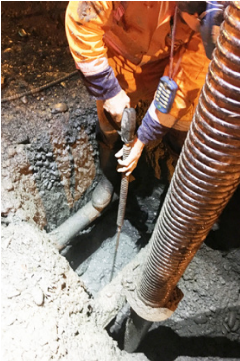
Above: a hydrovac at work.

We know this work is disruptive so we aim to complete this work as quickly as possible.