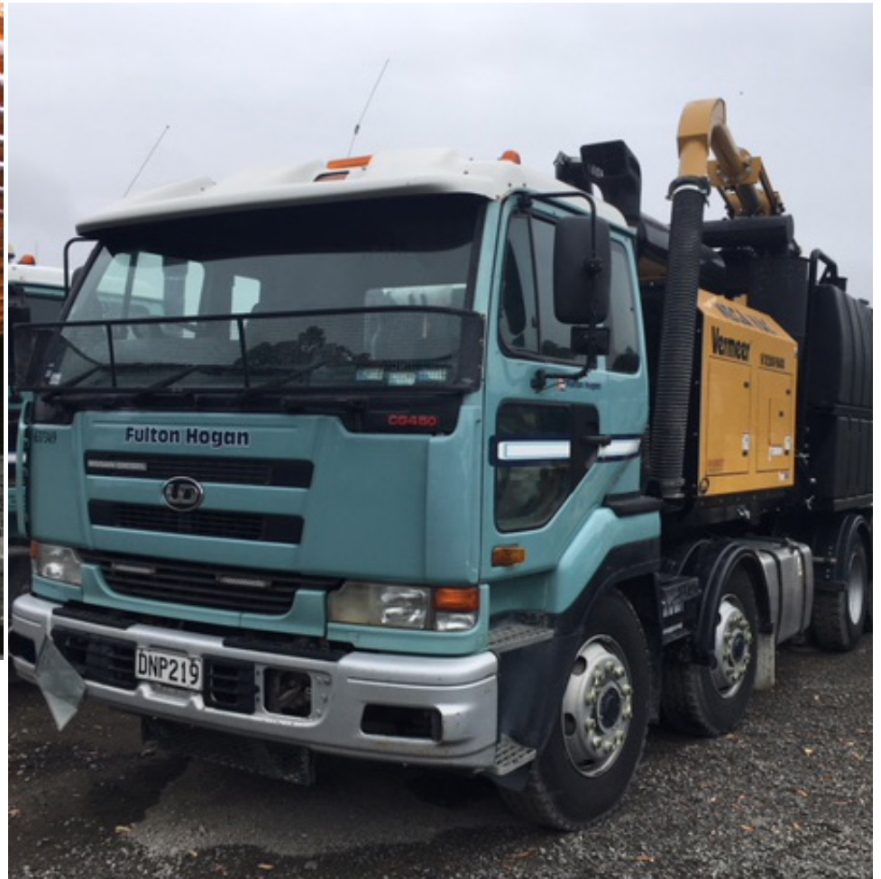
Right: example of a hydrovac.