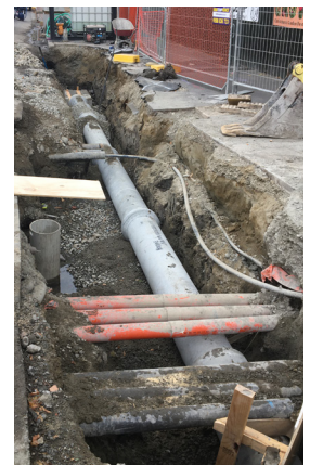
Above: Example of new drainage laid at of Barbadoes / Warrington intersection.

During the final stage of work we expect to complete kerb, channel and footpath on east side of intersection.